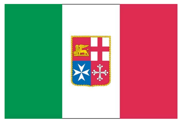
Italian Merchant flag from 9 November 1947.

The Lion of St. Mark also appears on the shield of the Italian maritime flags. Italy had used the coat of arms of the Royal House of Savoy (a white cross on a red shield with a blue border) on its national flag, and civil and naval ensigns until 9 November 1947, when the monarchy was abolished.