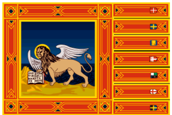
Flag of Veneto Region From 1975