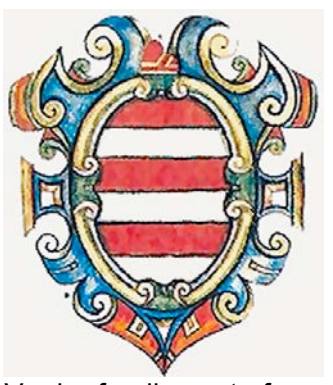
Venier family coat of arms

As one of the Ionian Islands, Kythera has shared a complex history of conquest, trade and shared culture with Greece, the Byzantine Empire and Venice. In ancient times Kythera was settled by Greeks from the Peloponnese, which became controlled by the Roman Empire, and from 395 AD, by the Byzantine Empire. As a consequence of the conquest of the Byzantine Empire by the Fourth Crusade in 1204, Crete became controlled by the Republic of Venice, whilst Kythera became a possession of a Venetian noble, Marco Venier and the island was renamed Cerigo. Venice took formal control in 1325, though the Venier family remained major feudal landowners for several centuries. This was the first of the Ionian Islands to become a possession of Venice.