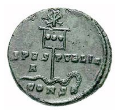
Byzantine coin 610 AD