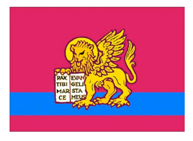
Venice merchant shipping flag

In practice simpler versions of the Venetian flag are made with less elaborate decorations, though they usually retain the gonfanon. In many depictions the lion stands on both water and land (often with a castle on a mountain) symbolising the Veneitan Republic's dominance in the hinterland as well as in the