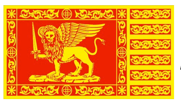
Left: The Lion of St. Mark has two versions - "peaceful" holding an open book inscribed Pax Tibi Marce Evangelista Meus, and the "warlike" version, holding a sword, and the book closed under its paw.