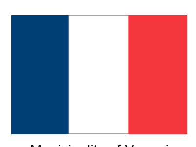
Municipality of Venezia May 1797 – Jan 1798

Ionian Islands 1807 – 1809 (1814 on Corfu)